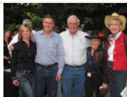
Packard Hospital doctors...